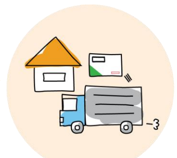
Ship the photos