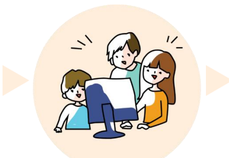
Look at on the Internet