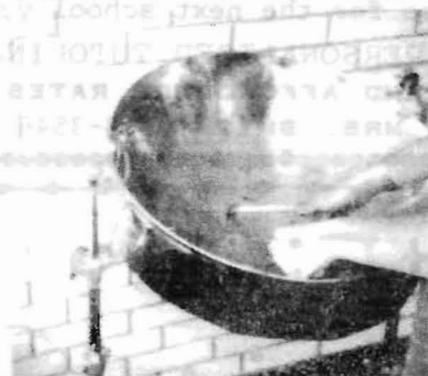
THE STEEL DRUM SHOWING INDENTATIONS AND OCTAVES