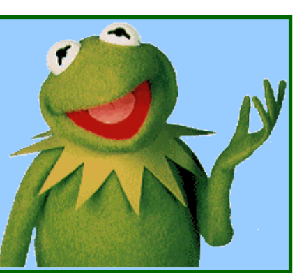
It's Easy Being Green