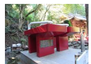
Big wooden clogs