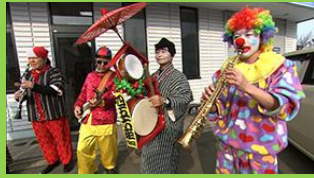
Chindonya (street musicians)