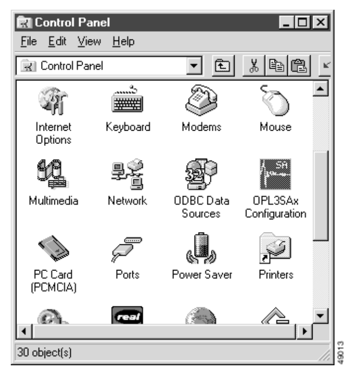
Step 2 Double-click the Network icon. The Network window appears.